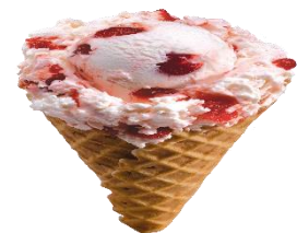
ice cream cone